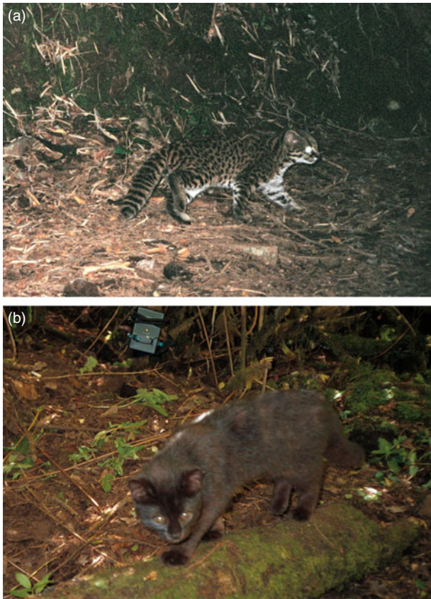
PLATE 1 Spotted (a) and melanic (b) guiñas Leopardus guigna photographed by camera traps.

c. 30% of photos) and difficulties in obtaining photos of both sides of the animal support the use of occupancy models based on presence–absence data.